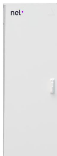
Hydrogen Supply Cabinet