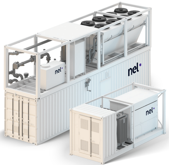
Power Supply Enclosure, Electrolyser Enclosure and optional Thermal Control System – installation may vary.