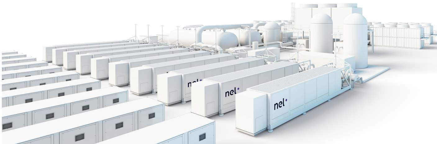
100 MW PEM electrolysis plant featuring ten PSM containerized modules.